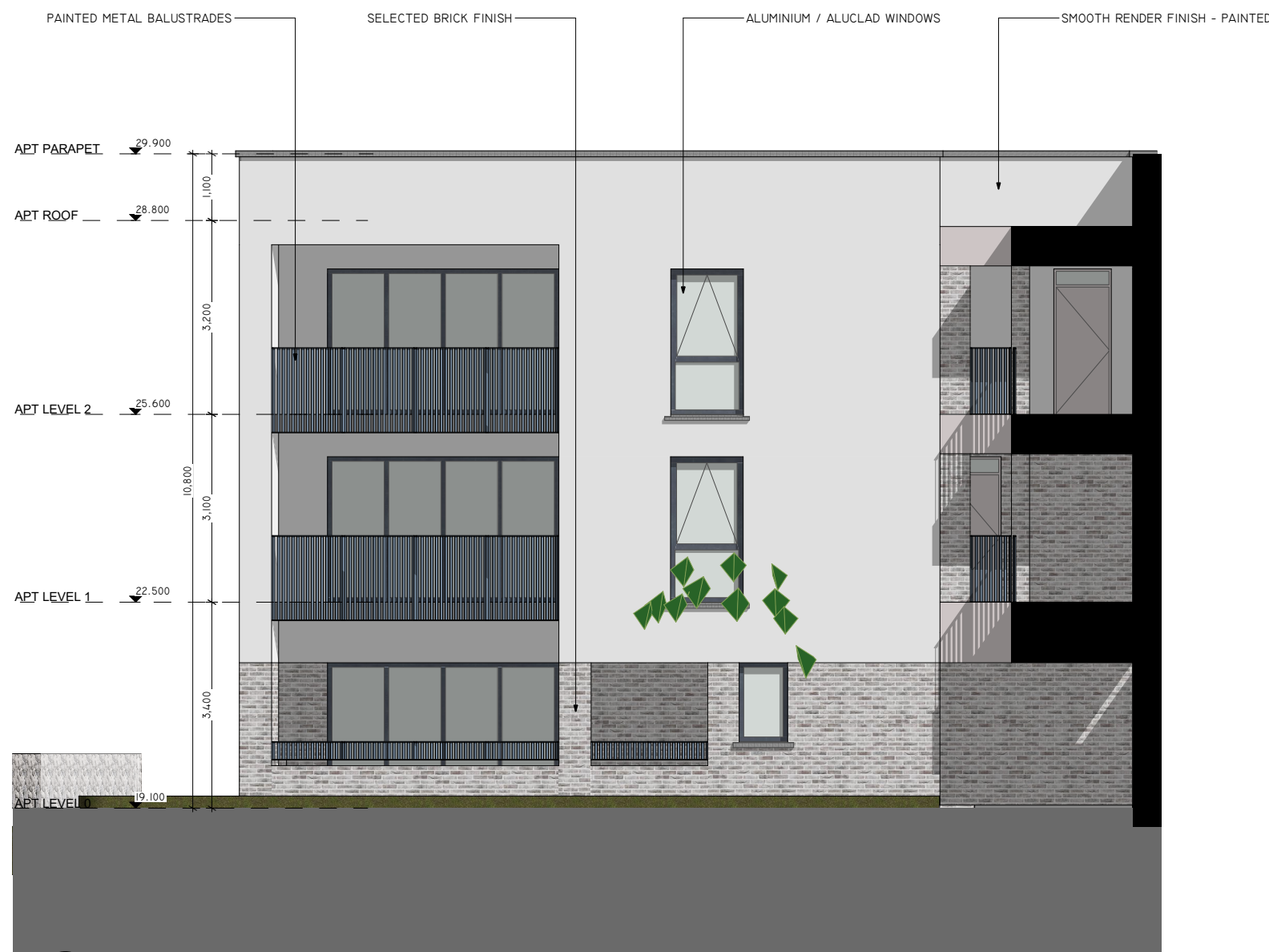
E10 APARTMENT COURTYARD SOUTH P17 1:100