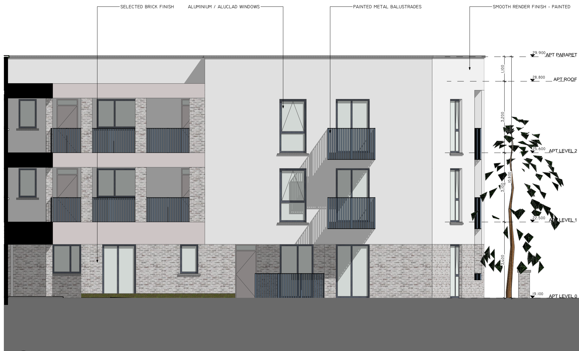
E09 APARTMENT COURTYARD NORTH ELEVATION P17 1:100